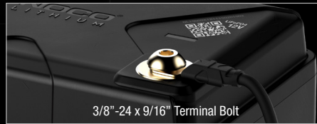
3/8"-24 x 9/16" Terminal Bolt

NLX Terminals offer versatile customization options to fit your dual purpose needs across various applications.