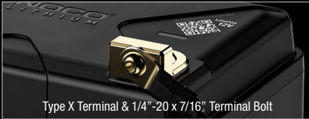
Type X Terminal & 1/4"-20 x 7/16" Terminal Bolt