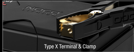
Type X Terminal & Clamp